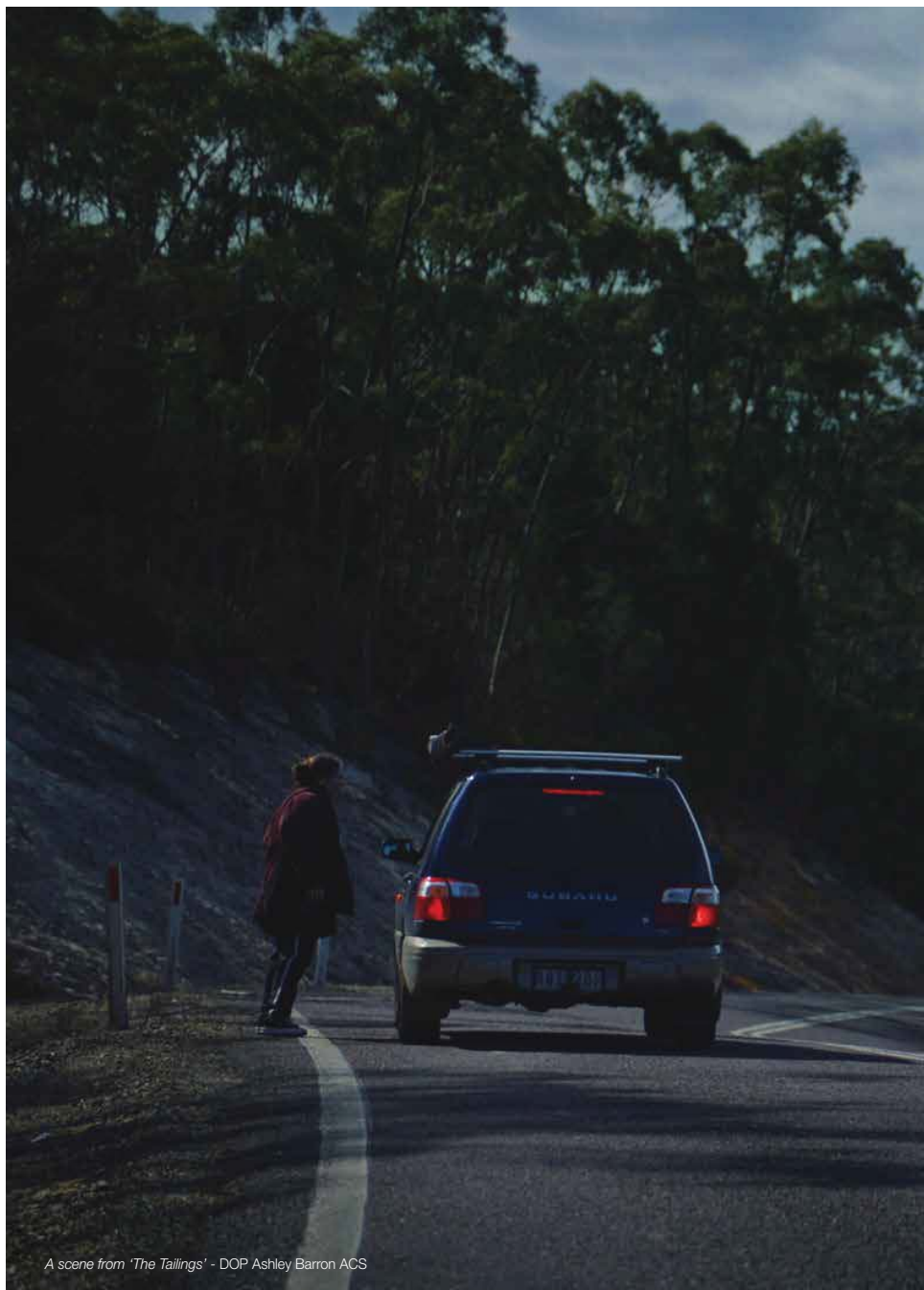
A scene from 'The Tailings' - DOP Ashley Barron ACS